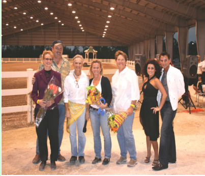
A Winning Team Make for a Great Show!!!