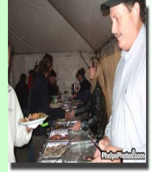
Fabulous Food at GCDA Opener CDIW Party