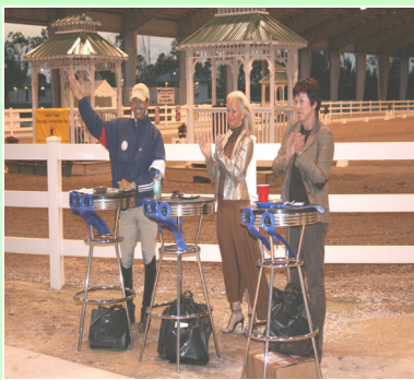
Celebrity Dance Judges Robert Dover & Tami Hoag