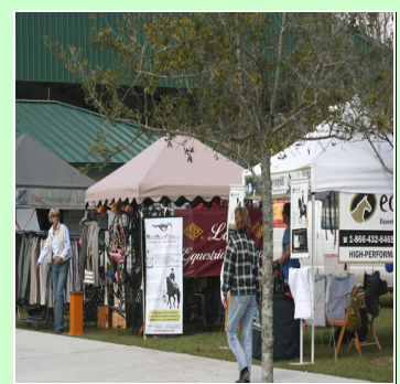
Great Shopping at Our Our Vendor Boutiques