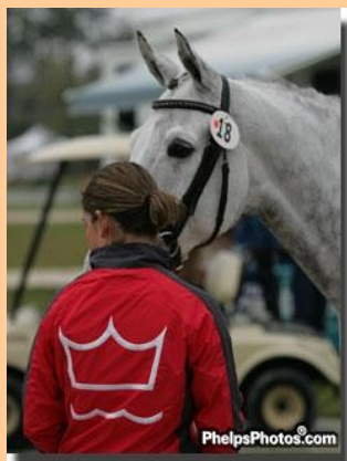
Participants in the CDI/WY present their horses at the Vet Inspection Jog

Why Dressage? Dressage is the largest FEI (Federation Equestre Internationale) discipline within the sport-horse category in the U.S. Featured as an Olympic sport since 1912, dressage focuses on the unity between horse and rider, with horses competing at top levels well into their late teen years. Opportunities exist for every level of competition for juniors/young riders, adult amateurs, and professional riders & trainers.